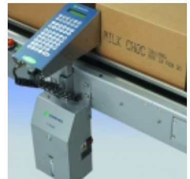
Small, compact and unobtrusive