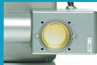
Our next generation of primary coders deploy our unique intelligent Technology system, i-Tech . Our aim was to make production lines lower maintenance, lower cost and more efficient. i-Tech has helped us to achieve that aim.