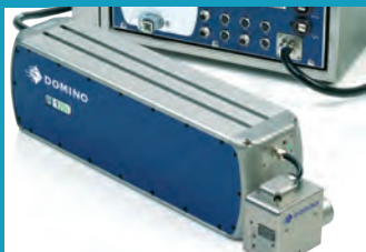
IP65 option for more protection