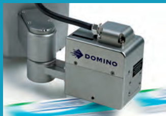
New i-Tech RapidScan coding technology for ultra fast performance